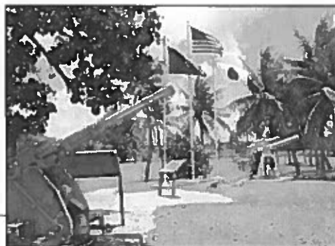
War in the Pacific National Historical Park, Guam.