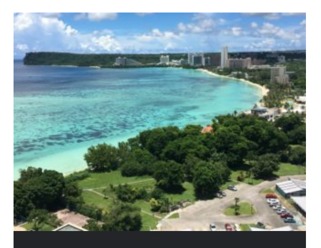
Tumon Bay, Guam, is a popular tourist destination.

"I just reassured them that the military are protecting us and that we have defences in place. If children see their parents are calm, they feel a bit more reassured.