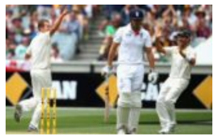
Peter Siddle: What it's really like to play in a Boxing Day Test