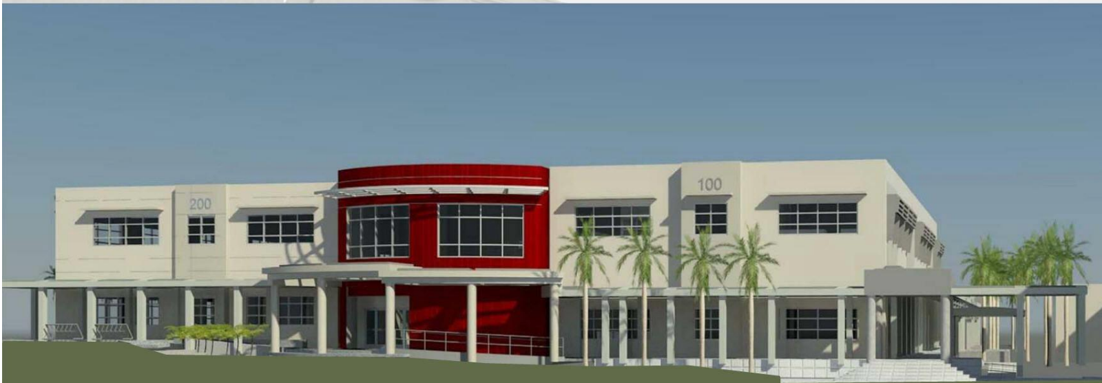
GCC BUILDING 100 RENOVATION