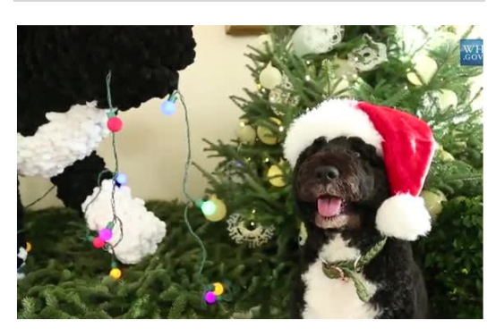
White House Dog Bo Has Christmas Video